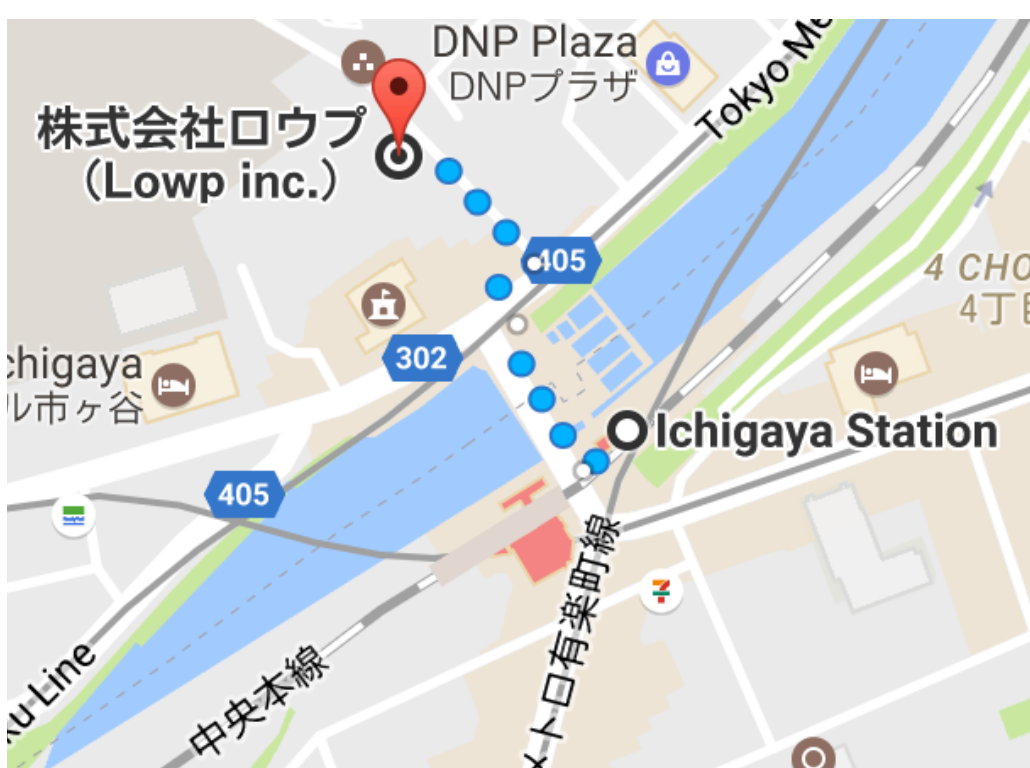
Map to Lowp - 4F in Ichigaya

http://makertoolset.com/MinecraftSummer2017/